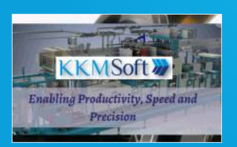
Design Solution Partner KKM SOFT - Visual Interlude