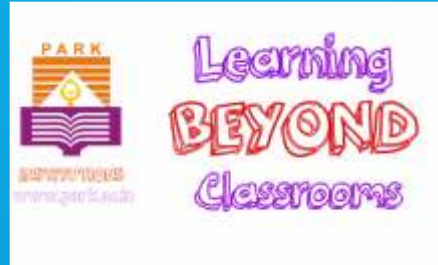
Academic & B-School Partner PARK GROUP OF INSTITUTION - Visual Interlude